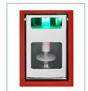
Less than 50ppm

FIJI is the only test that can screen for all types of FAME.