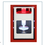
More than 50ppm